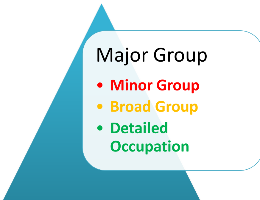
Figure 1. Hierarchical Relationship of Occupational Groupings